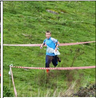
Sprint 27 th Individual 13th