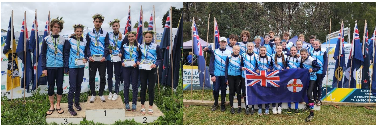
Photos: Below – NSW podiums at the individual. The NSW Team celebrating their win.