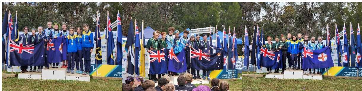
Photos: Above Senior Girls, Senior Boys and Junior Girls podiums.

In the Teams Points competition NSW won the Senior Girls, Senior Boys and Junior Girls. A great achievement for NSW. This is a combination of the results from the sprint, individual and relay.