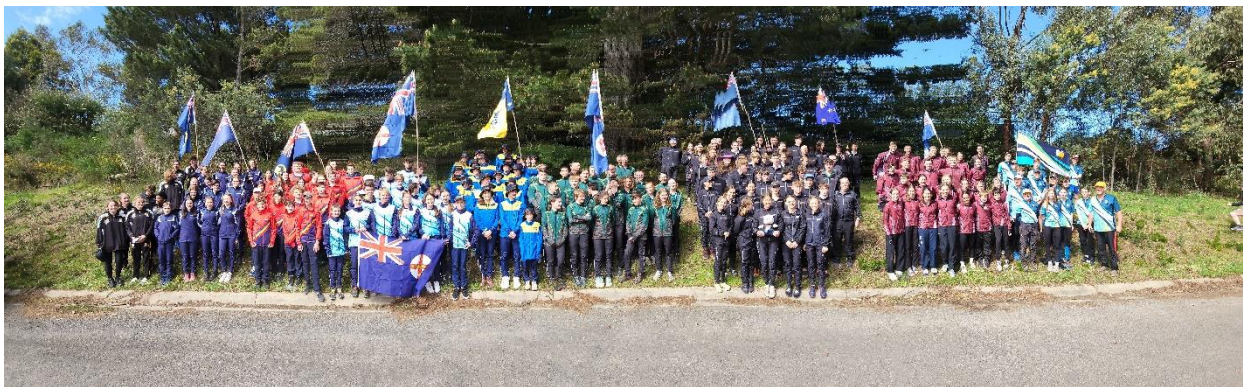
Photos: Above-The Australian Schools Teams at the opening ceremony.