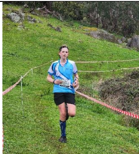
Sprint 19 th Individual 17th