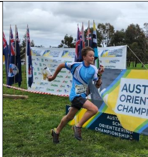
Sprint 12 th Individual 4th