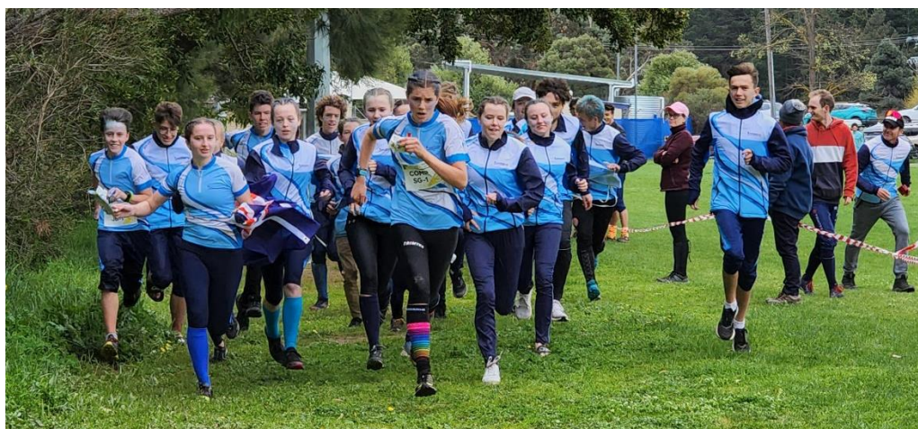
Photo: Above The NSW Team all running in with our final relay runner as the champion state.