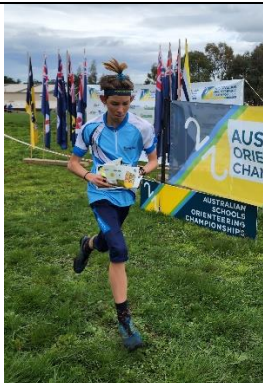
Sprint 8 th Individual 16th