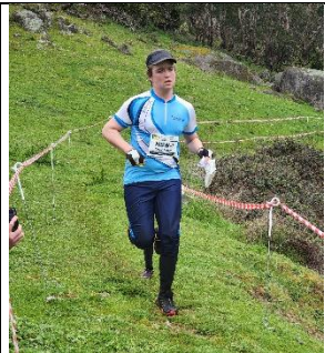
Sprint 24 th Individual 24th